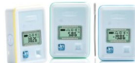
LoRa® SPY T2 -50°C to +105°C Temperature sensor with external probe for freezer refrigerator and incubator