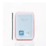
Nano SPY T3 0°C to +260°C -200°C to 0°C Extreme temperature sensor with external probe