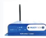
Gateway Transmission of data to the JRI MySirius cloud

Flash the code and watch the JRI MySirius video