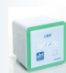
LINK Transmission module