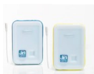
Nano SPY T2 -50°C to +105°C Temperature sensor with external probe for freezer or incubator