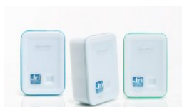
Nano SPY T1 -40°C to +85°C Temperature sensor for freezer, refrigerator Ambient