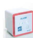
ALARM Alarm & Relay module